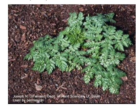
Poison hemlock adult plant (8-10 ft tall)