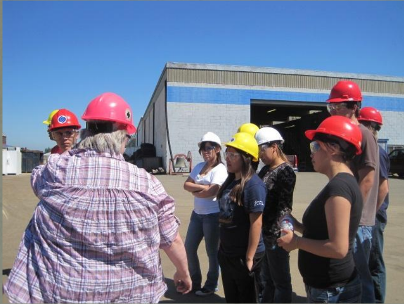
Youth learning about the recycling process at Skagit River Steel and Recycling