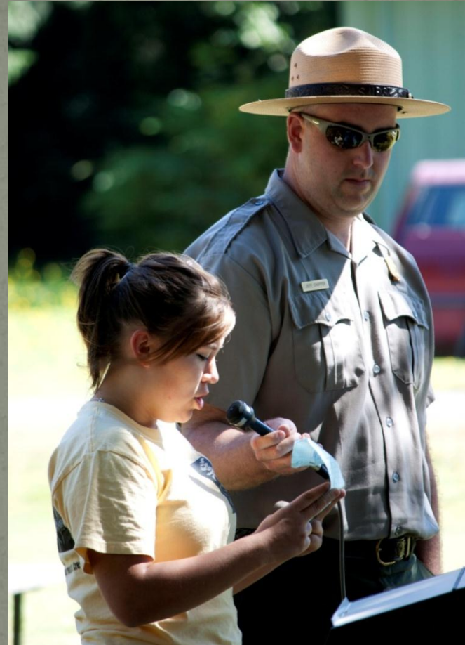
A youth worker talking about her summer work experience