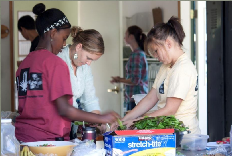
Native youth working with NOCA volunteers to prepare lunch for the Traditional Plant Class