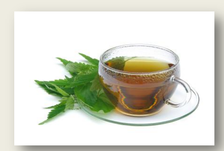
Herbal Tea Dispensary